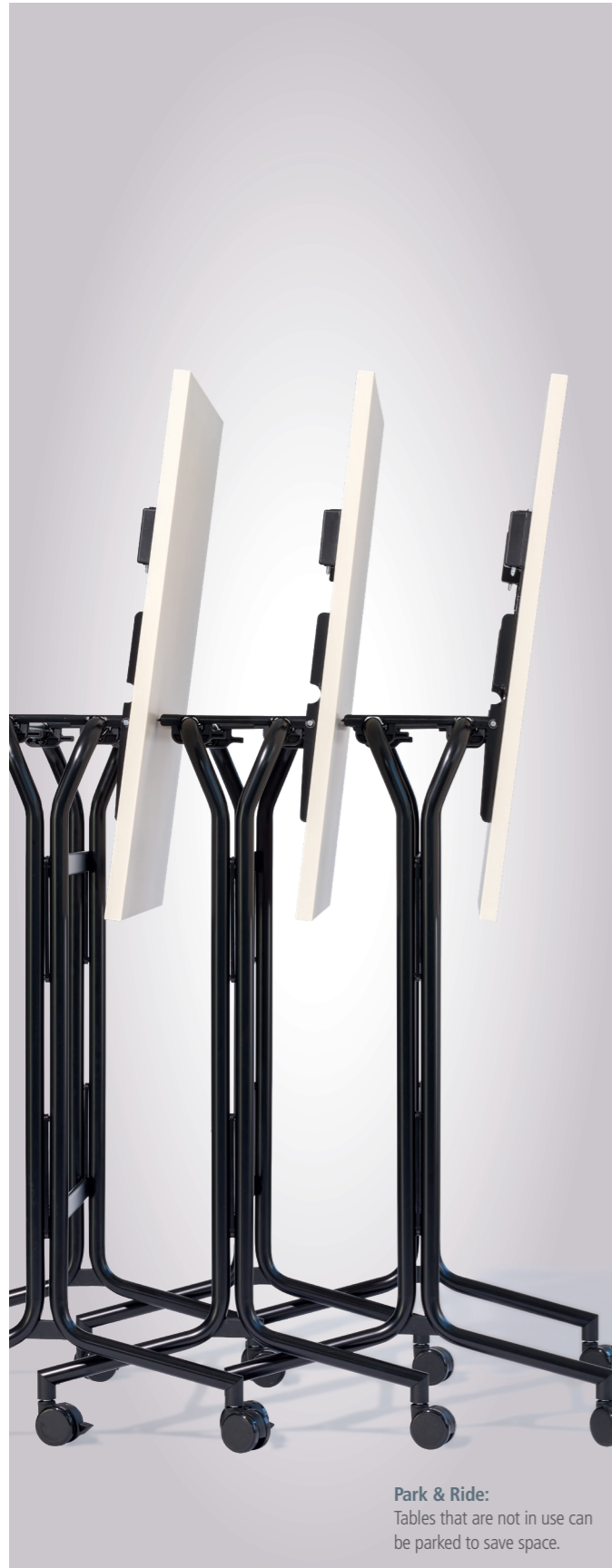
Park & Ride: Tables that are not in use can be parked to save space.