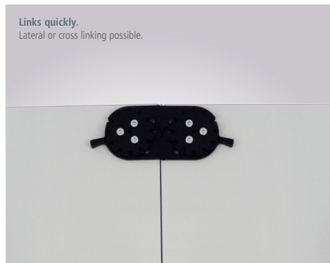
Links quickly. Lateral or cross linking possible.