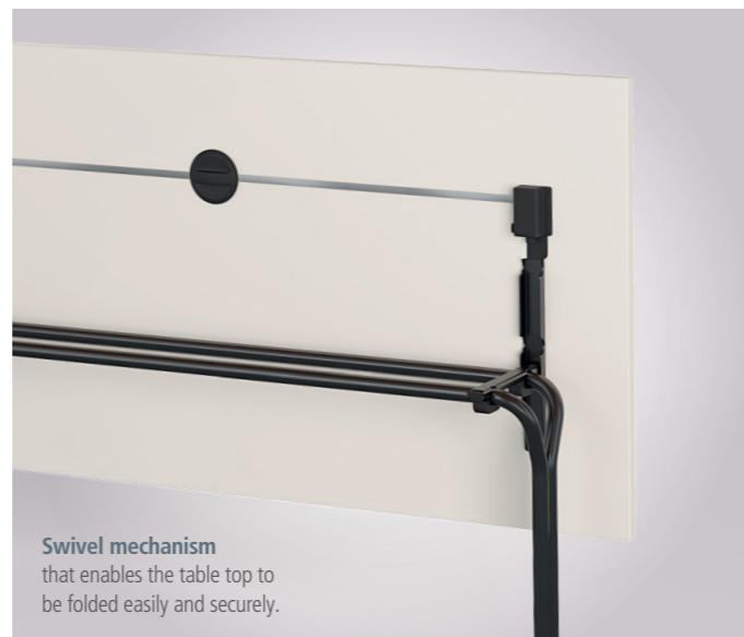
Swivel mechanism that enables the table top to be folded easily and securely.