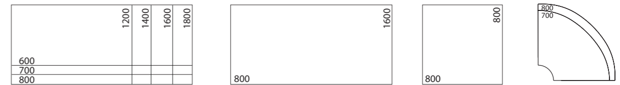
Rectangular table Rectangular high table Square high table Corner slot-in leave