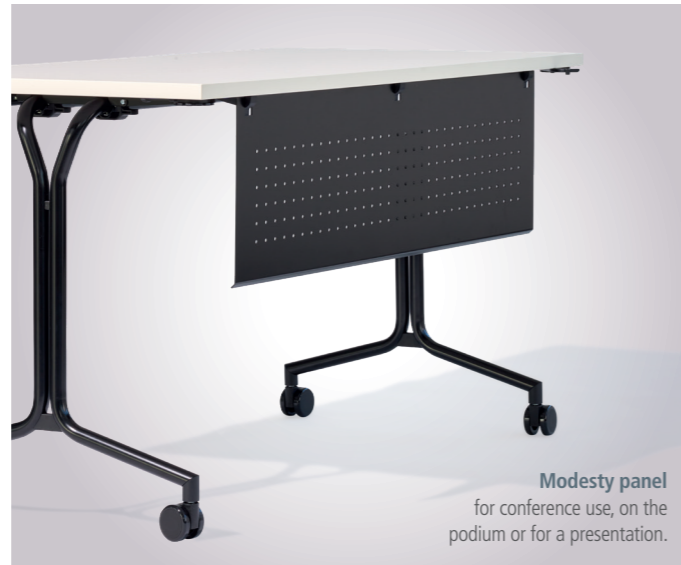
Modesty panel for conference use, on the podium or for a presentation.