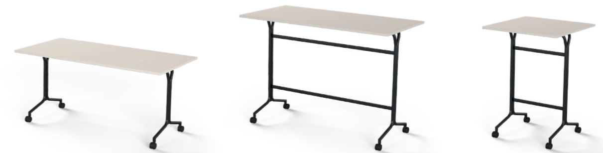
Rectangular table Rectangular high table Square high table