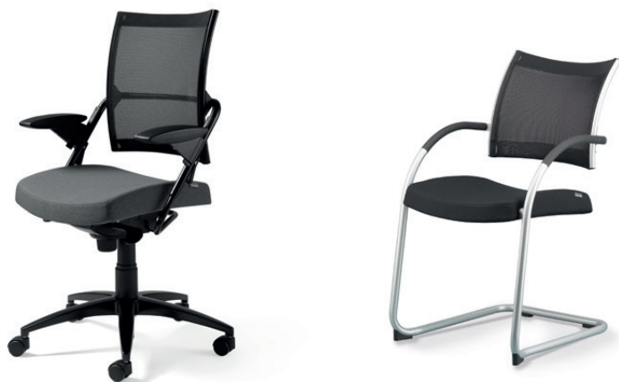
Swivel chair with height-adjustable arms