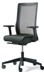
Swivel chair with height-adjustable arms 5431-101A assembled