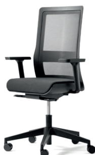
Swivel chair with multifunctional arms 5433-101A assembled

poi represents a completely new generation of swivel chairs: the perfect combination of aesthetics, comfort and well-engineered ergonomics makes poi both unique and economically attractive. The characteristic feature of poi is the elegant monocoque design. The ergonomic and dynamic back frame in black or white is covered with a semi-transparent net mesh.