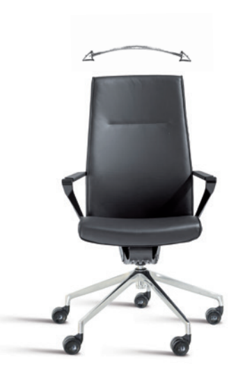
The ergonomic design of delv combines a dynamic seating philosophy with trendsetting kinetics.