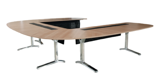
pulse conference table

A-4950 Altheim Linzer Strasse 22 T +43 (7723) 460-0 altheim@wiesner-hager.com